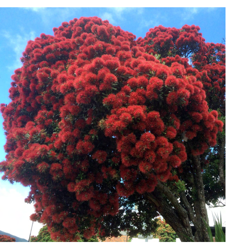
The pohutukawa are blooming, persona which we hope means a settled and sunny holiday time. in 2014.

If you write an agricultural or rural-based blog and want it to have wider exposure, drop me a note and I will compile a lists. email kotuku.media@xtra.co.co.nz