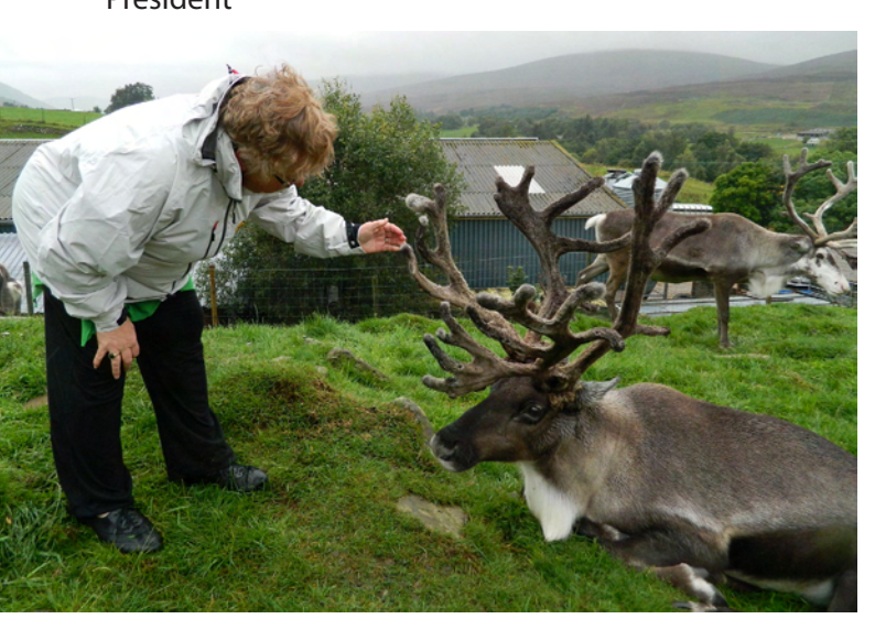
No reindeer were harmed in the making of this newsletter. **