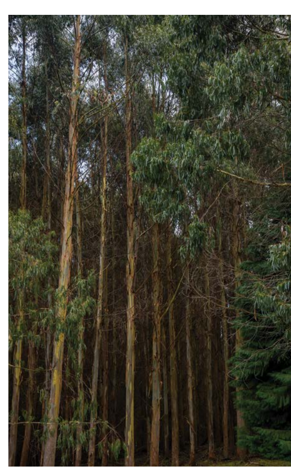
Gum trees don't make good neighbours as they shade pastures and spoil the view.

Southland District Council was so keen on planting its own forests it relaxed the