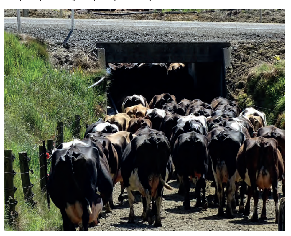
An underpass connects the farm that straddles the highway.

Plus, with the collars, they know exactly what each cow is doing as well as her health, whether they are in the paddock or not.