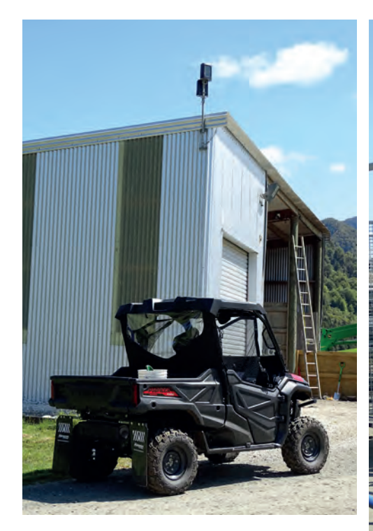
ABOVE: The receivers on the roof enable information to be downloaded from the collars. RIGHT: Cows can be automatically drafted from collar information.

Adam says scales could be added at the exit race to record cow weight and the system could be linked to milk meters to show how much milk each cow is producing at each milking. That would add weight to the data recorded, alongside rumination and activity. As sharemilkers, he says that is not an option as it would mean spending money to upgrade the dairy.